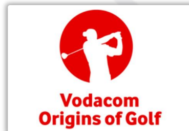
20 th - 22 nd September 2024 Vodacom Origins of Golf - Sishen Sishen Golf Club