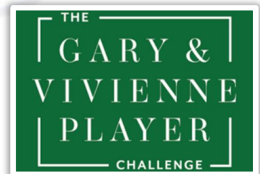
28 th - 30 th August 2024 Gary & Vivienne Player Challenge Kyalami Country Club 3 Rounds Price Fund: R2 000 000