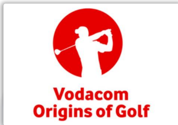
16 th - 18 th August 2024 Vodacom Origins of Golf - Mpumalanga Highland Gate Golf & Trout Estate 3 Rounds Prize Fund: R2 000 000