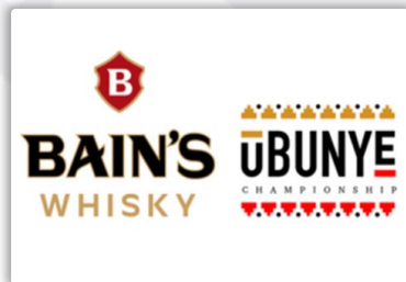
12 th - 15 th September 2024 Bain's Whisky Ubunye Championship Silver Lakes Golf and Wildlife Estate